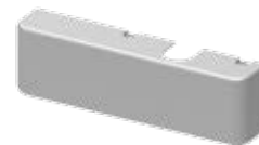
4040XP-72MC Metal Cover