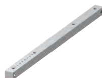
2030-3038H Hold-Open Track