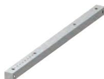
2030-3038 Standard Track