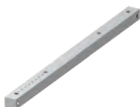
2030-3038B Standard Track with Bumper