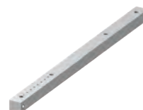
2030-3038HB Hold-Open Track with Bumper